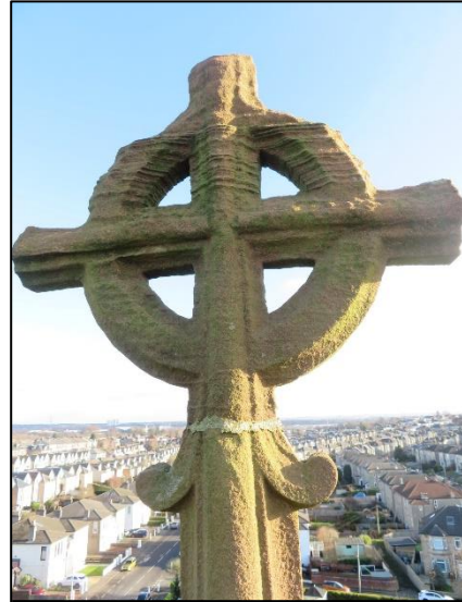
Our cross was inspected by one of the tenderers. Thankfully, while suffering bad erosion, it is stable and does not require major works.

If you have any questions about this work, please speak to any of the Managers.