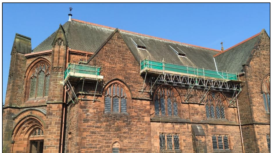
South side high level suspended scaffolding – nearly complete.

Stuart Menzies , Convenor of the Managers