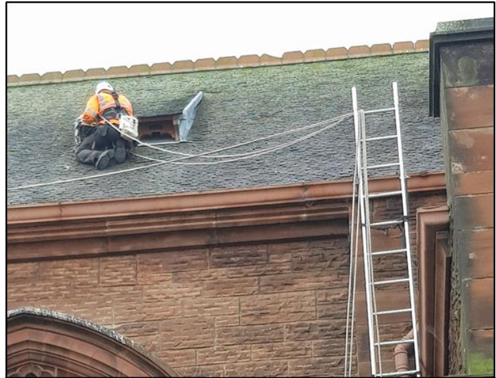
(Left) Steeplejacks' ladder (Above) Painting the vents. A good head for heights is required!

In addition, we decided to address our pigeon problem - droppings have been building up on some of our windows and other ledges and this is slowly damaging the stonework as well as being a potential health risk to us. We decided to fit bird spikes to the worst affected areas as a deterrent. Airtex also cleaned off the droppings, being careful to avoid damaging the sandstone.