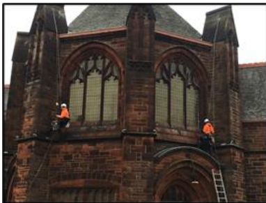
(Left) Cleaning the pigeon droppings and fitting bird spikes (Right) The drone survey

The cost of the initial completed works is just over £14,000. This includes VAT but we should be able to reclaim the VAT element through the Listed Places of Worship Grant Scheme. As mentioned in the treasurer's report over £6,000 (before Gift Aid is added) was given in September's National Giving Day. Thank you for supporting this important work on our building. We will be seeking quotes for the other maintenance works identified.