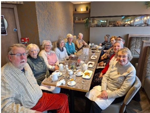
At the King's Park Hotel, February 4th 2024

The Lunch Bunch is a group of Stonelaw Church folk who usually meet on the last Sunday of the month after the morning service, for food and fellowship somewhere locally. It's an intergenerational group and we simply enjoy a chat with each other over a meal.