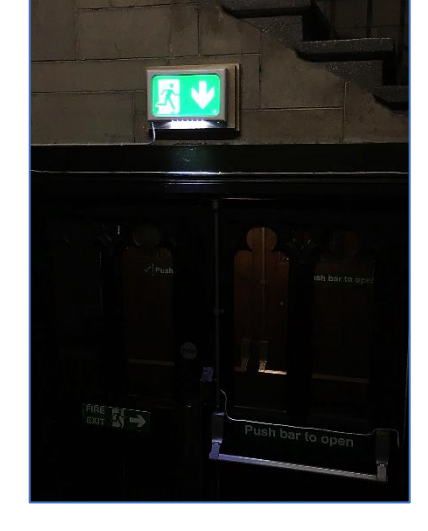
New NW stairwell emergency light

We have also installed three additional emergency lights: at the bottom of the north-west stairwell; in the halls' kitchen corridor and in the corridor behind the Sanctuary at the