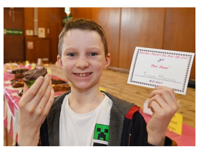
ED Thanks to the Rutherglen Reformer for allowing us to use these great photos!